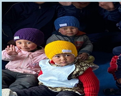
Hats, Hats and more BTW hats to keep those little heads warm. Just look at those smiles!