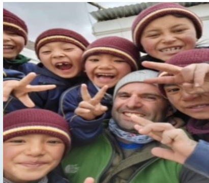
Interacting with the Children