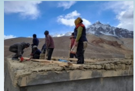
Working with the community on the roof