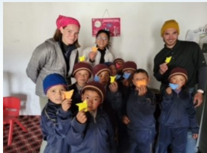
In the Classroom

They say a picture is worth a thousands words so here is “Team Determination 2022” at work .