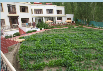
Sia La Guest House

India is one of the most unique places on earth. It has the largest population in the world, and every state has its own language with multiple dialects. It is one of the oldest cultures in the world.